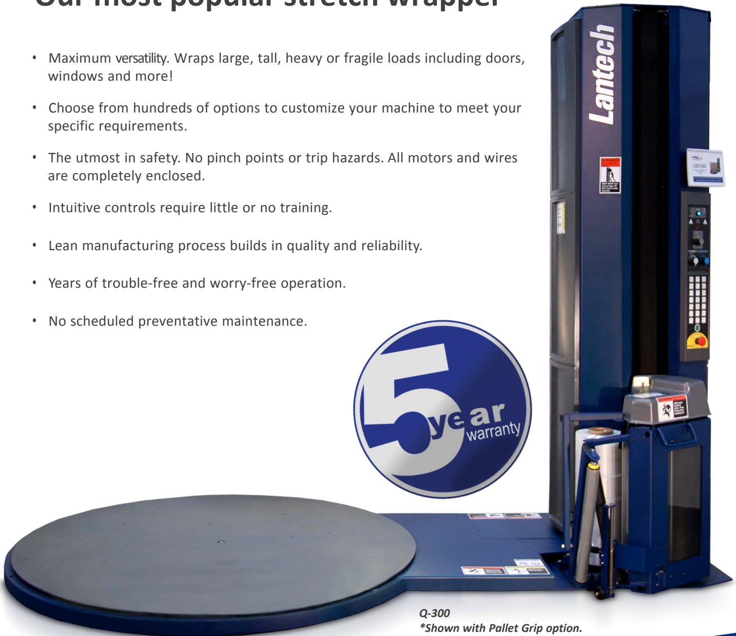
Q-300 *Shown with Pallet Grip option.