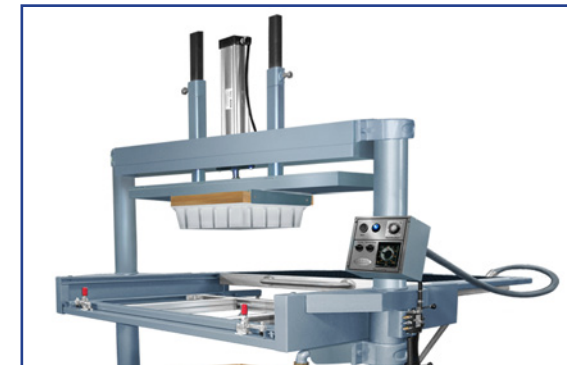
Option: Vacuum Former with Overhead Assist