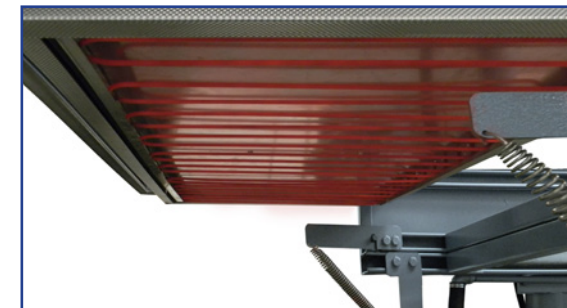
Infrared Heater Panel Featuring: 15,000 Watts of 0 - 100% Heat Controlled

For more information please contact your Belovac Representative at 951-741-4822 or at jb@belovac.com or visit www.belovac.com