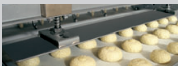
Squashing tips device.