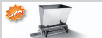
Soft dough head with pump, with staggered teeth rollers.