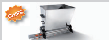
Hard dough head with rollers "America" type.