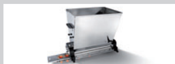
Hard dough head with rollers.