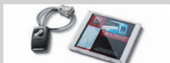
Memory card and CD Proges software.

Final products pictures are purely representative. Drawings and technical data can be modified without prior notice from the manufacturer.