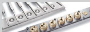
Dies and nozzles.