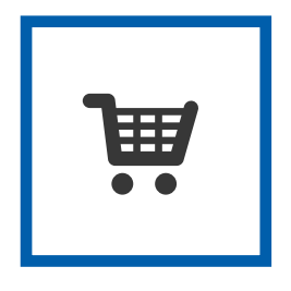
83 Assets Sold

EquipNet met the client's deadline and provided optimal results far better than anticipated.