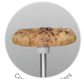
Cookies and Crackers