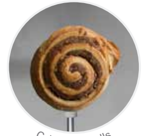
Cakes and Rolls