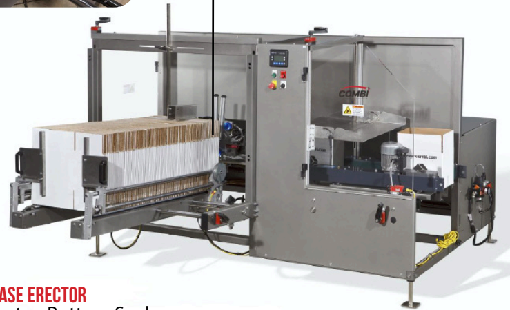
2-EZ ® HS CASE ERECTOR Case Erector, Bottom Sealer