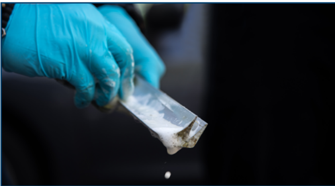
SIMPLE & SAFE TO OPERATE

Each TriFlex blade cartridge is custom made in-house by Mobius using our proprietary tooling. Helical blades are nitrided to harden their surface and black-oxidized to prevent rusting. Cartridges are held in place by tension, so they simply lift in and out of the machine by hand with no need to fuss with bolts or screws. Alignment will always be perfect with no adjustment or "dialing-in" required. You'll get a precision cut every time with no "clicks" or user error.