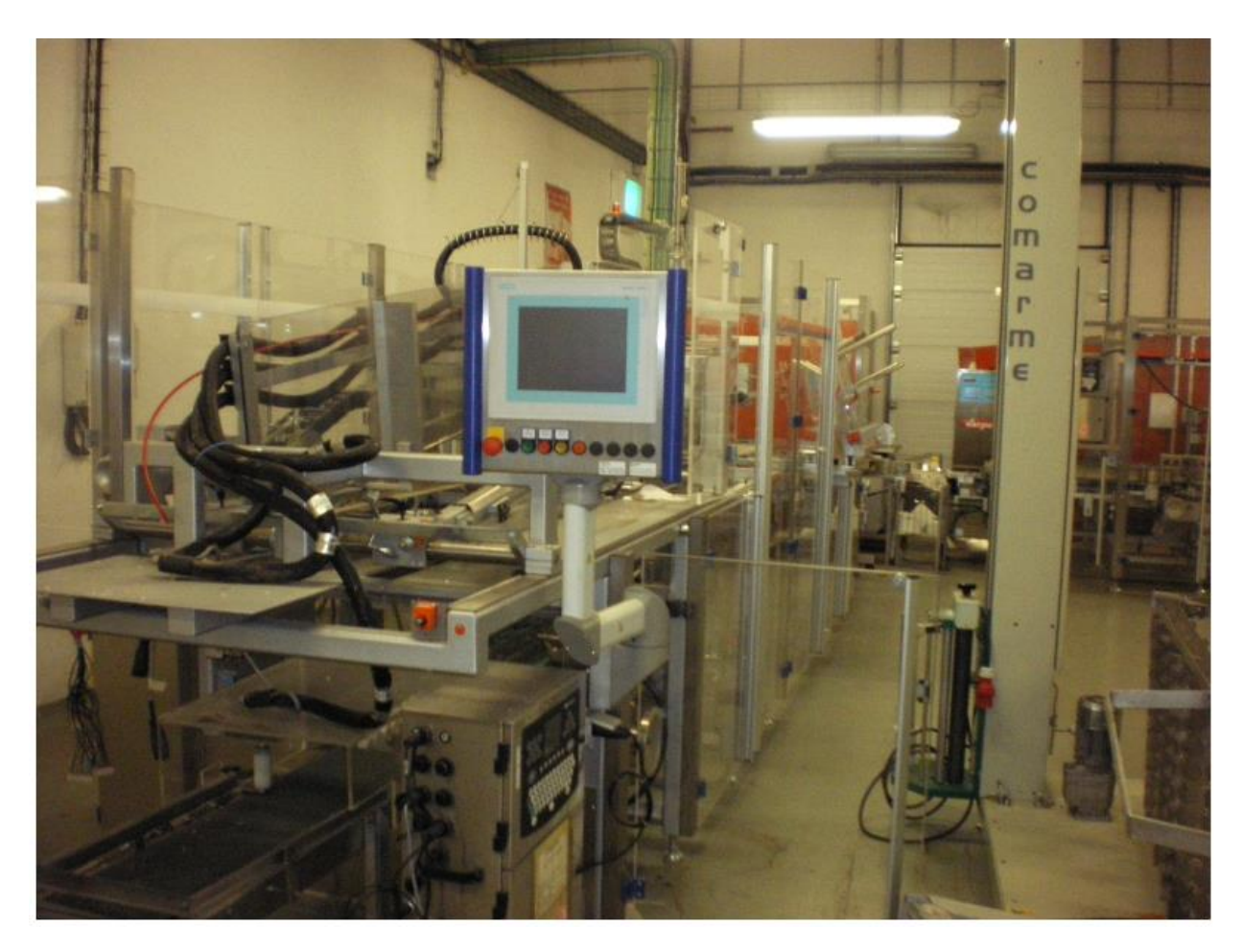
Machine front view. (out of the cases)