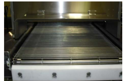
Opening to TC700W-I Enclosure