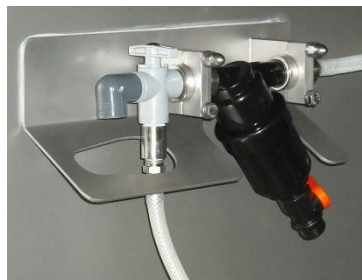
Intervention Supply Connection & Strainer