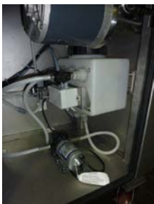
Integral RTU Tank and Pump

Both standard models come with "No Meat – No Spray", "a dislodged door/guard – No Spray or Motion", and "Low Spray Rate – No Motion" interlocks ensuring efficiency, operator safety and top product quality!