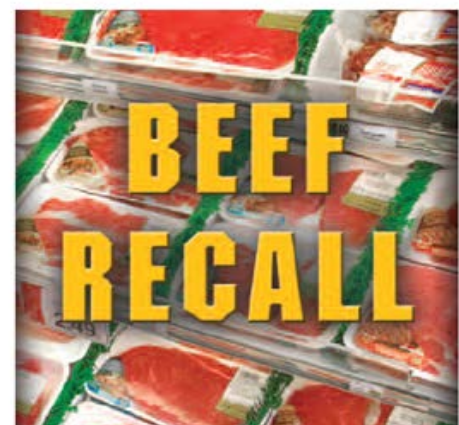
Product recalls can be regional or national and negatively impact your reputation and profitability.

Use sales@rossindinc.com or 800 336-6010 to have a Ross Sales Professional assist in tailoring an intervention system that addresses all your operational needs. To ensure you've considered all the critical parameters and aspects of this continually evolving technology including access to the recent Oklahoma State University Study (recognized by the FSIS Division of the USDA) conducted under plant conditions comparing 14 concentrates.