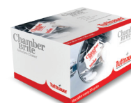
Chamber Brite Autoclave Cleaner