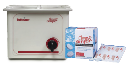
Clean & Simple™ Ultrasonic Cleaners and Tablets

Documents: date, time, temperature, pressure.